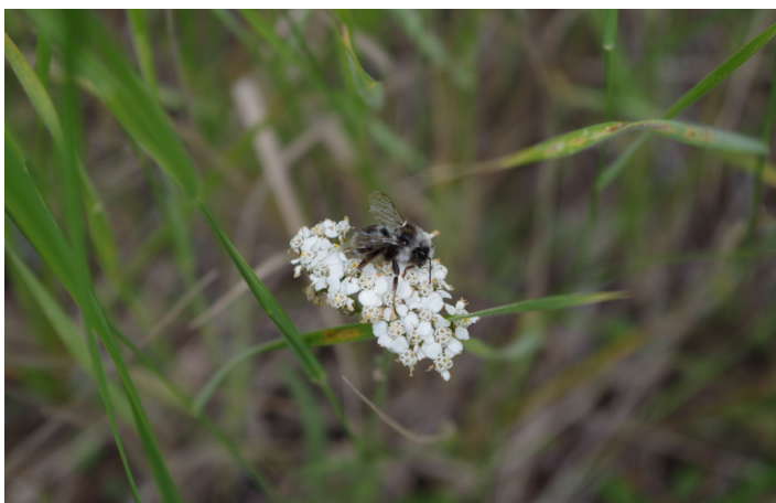
Common yarrow, a commonly visited flowering plant in the Meadow Creek restoration site, showed no response to grazing by deer and elk. (Photo by Sandy DeBano).