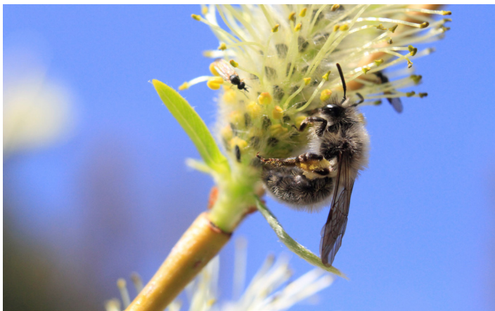
Plantings of mass-blooming shrubs like willows to enhance degraded riparian areas can also benefit pollinators such as native bees.

mammals may influence native bees. First, the team conducted a literature review aimed at understanding the potential of dietary overlap among native bees, deer, elk, and cattle, focusing on riparian species recorded along Meadow Creek within Starkey (DeBano et al. 2016). The review revealed that bees may use approximately 30% of plant species present in this riparian area; elk were reported as feeding on 43% of Meadow Creek species, deer were reported feeding on 19%, and cattle on 16%. The relative percentage of species documented in diets of ungulates that were also identified as important to bees was approximately 55% (DeBano et al. 2016). In summary, the literature review showed that ungulate grazers and bees have high potential for dietary overlap, with over half the species found within this riparian area that are believed to be important to bees also known to be consumed by ungulate grazers. Current research is underway to examine the realized resource overlap among these species in the Meadow Creek riparian area by documenting which plants are actually used by bees for nectar and pollen, and by comparing cattle vs. deer and elk impacts on floral resources. Bees make use of a variety of woody and herbaceous plants such as willows and yarrow.