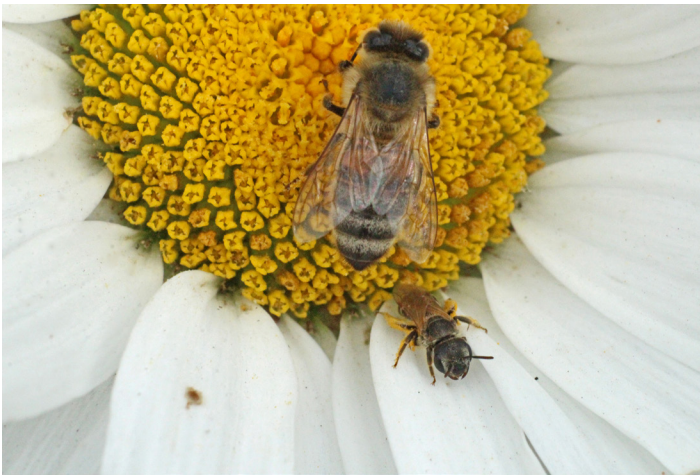
Many floral resources are visited by both managed honey bees and wild bees.

Can we predict the interaction between honeybees and native bees on natural lands, and how do we, as land managers, account for balancing multiple land uses? A key question has arisen in the case of support of honeybee health for agriculture, and the conservation of native bees: are honeybees outcompeting native bees for food resources in shared landscapes? Managed honeybees ( Apis mellifera ) and native bees both require nectar and pollen from flowers,